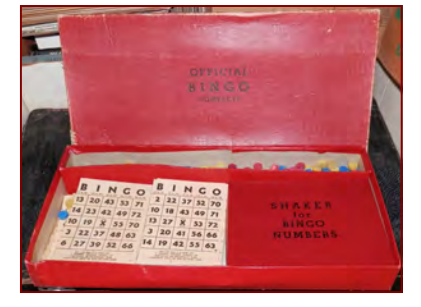
COLLECTIBLE BINGO SET