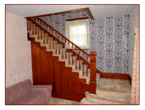
ORIGINAL WOODWORK BANISTER