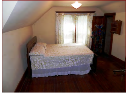
FIRST UPSTAIRS BEDROOM