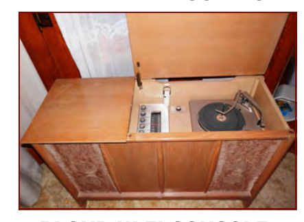
BLOND HI FI CONSOLE